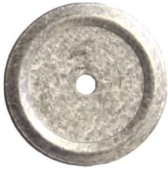
Flat 50mm diameter